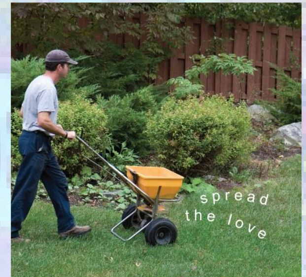
Buy phosphorus-free fertilizer and keep our water clean.

Don't feed the algae: Too much nitrogen and phosphorus grow scummy algae in our lakes. Do your part and help keep Colorado's water clean by using phosphorus-free lawn fertilizers. Learn more →